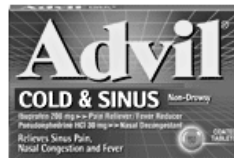
Advil Sinus Ibuprofen / Pseudoephedrine