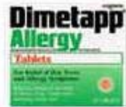
Dimetapp Allergy Brompheniramine